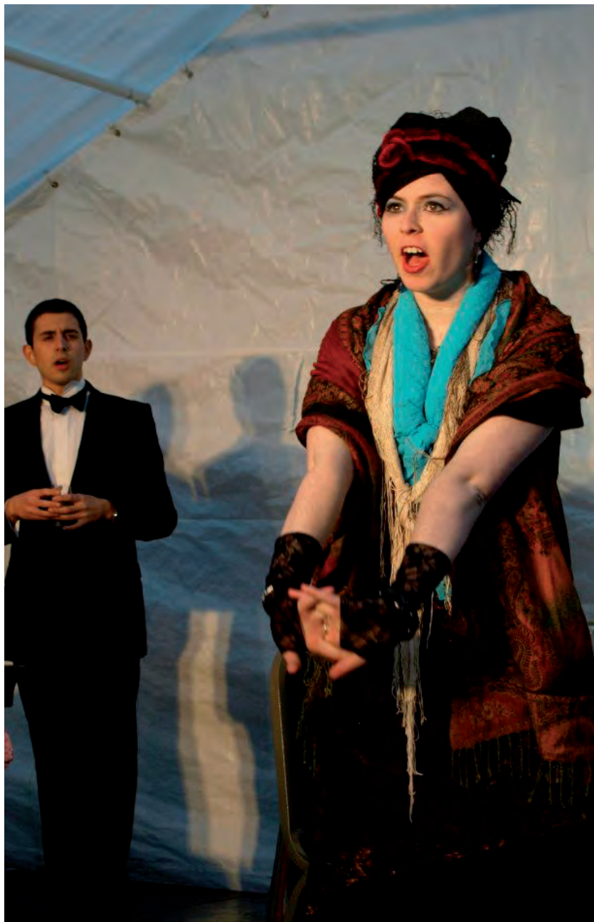
Blithe Spirit – Arts Week (see Reports p. 55)