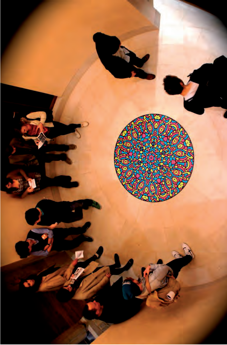
Out with the Old In With the New – BNC Rotunda during Arts Week (see Reports p. 55)