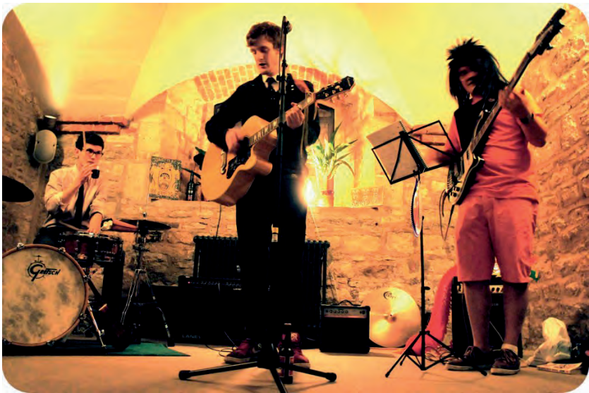
Stay for the Festival – Arts Week (see Reports p. 55)