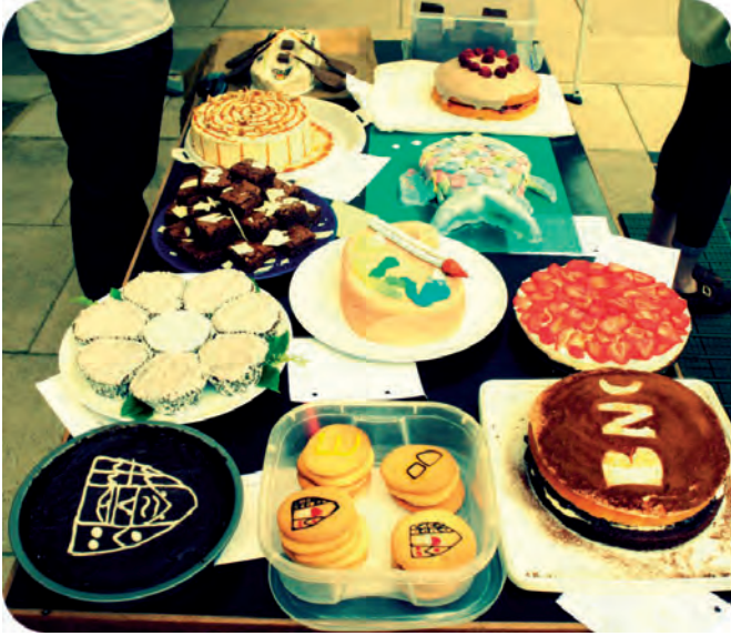
Much Adough About Muffin – Arts Week (see Reports p. 55)