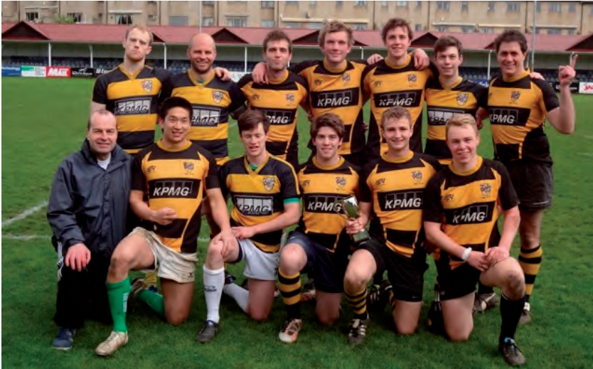
BNC 7s Champions (see Clubs & Societies p. 76)