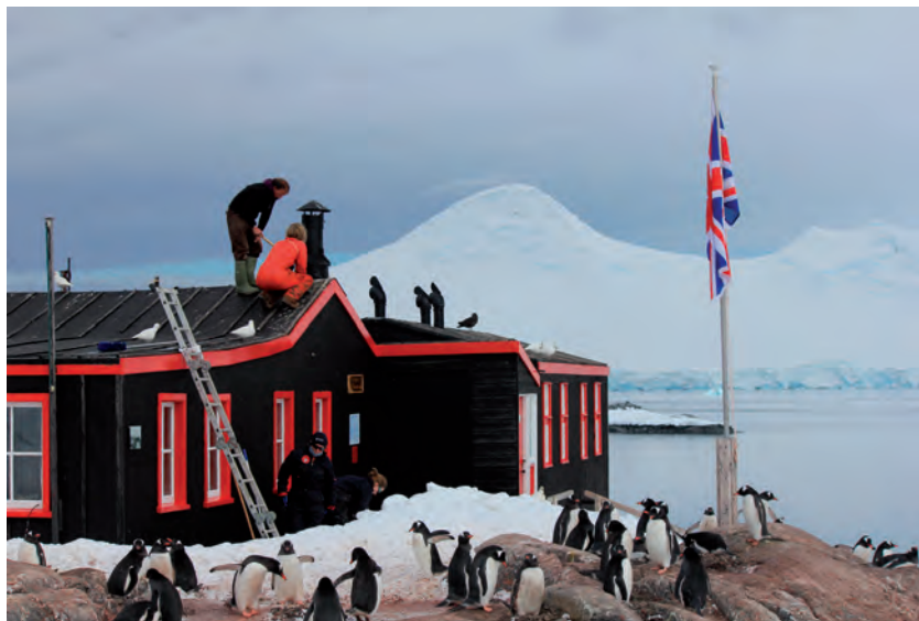
Repairing the roof at Port Lockroy between snow showers – Cat Totty (see Articles p. 101)