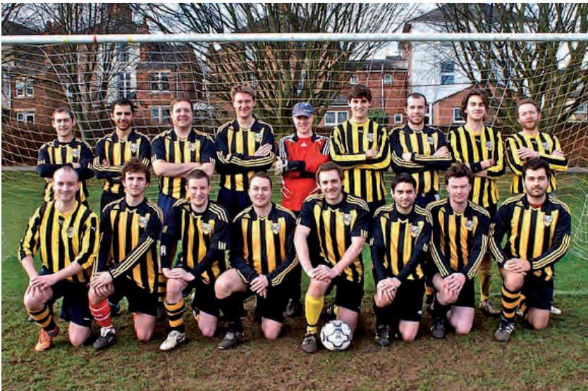
HCR Football Team (see Clubs & Societies p. 74)