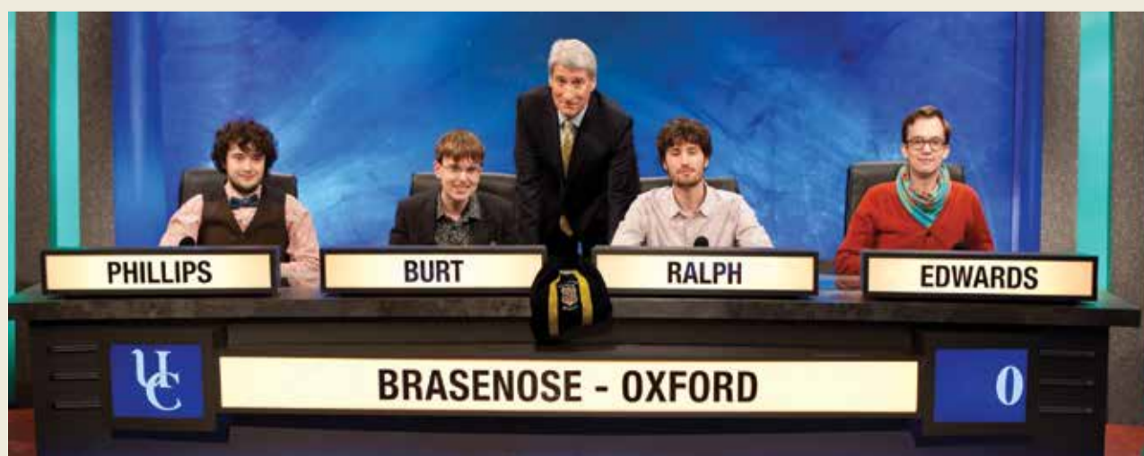
▽ Brasenose College team with Jeremy Paxman