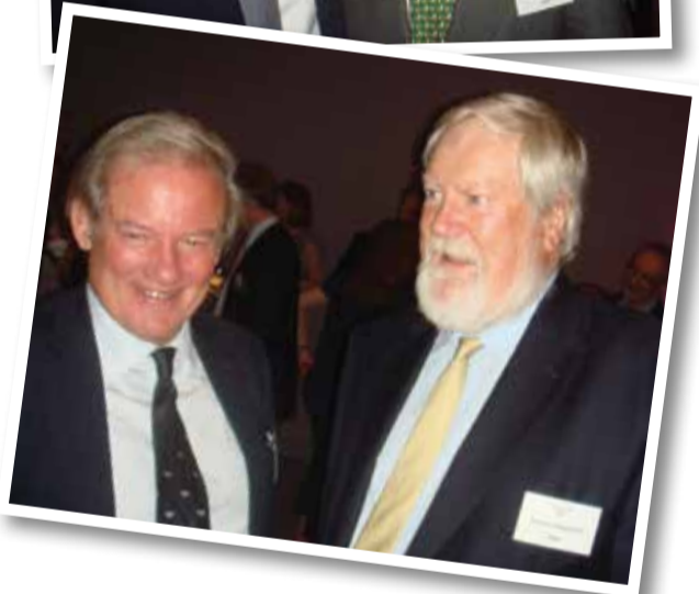
▷ Members gathered to toast the unveiling of the Platnauer Portrait , Friday 9 August.