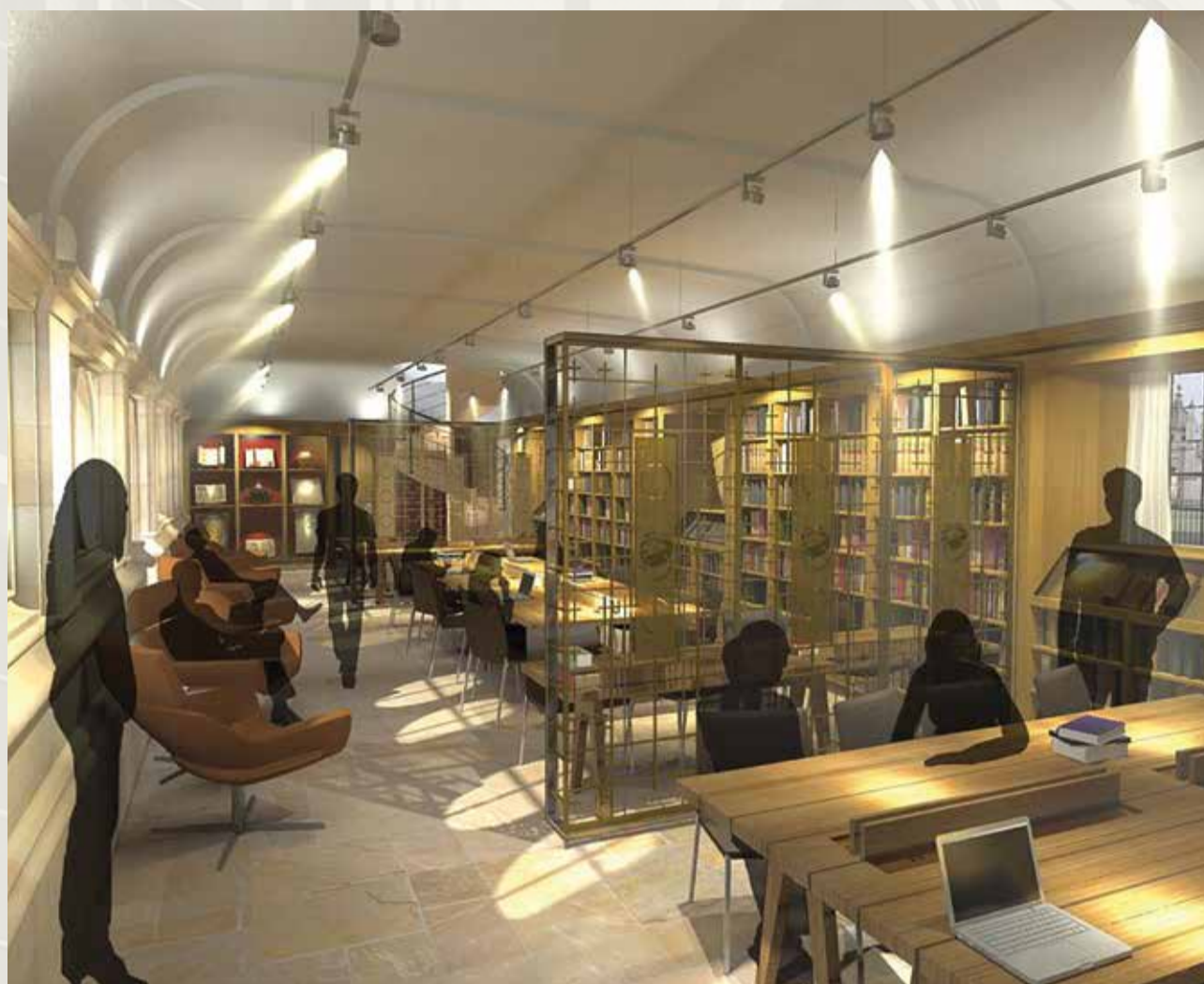
△ Architect's first impression of the improved Library, which will be extended into the Old Cloisters.

'This new library space will consolidate and galvanize the growing academic distinction of Brasenose's students'