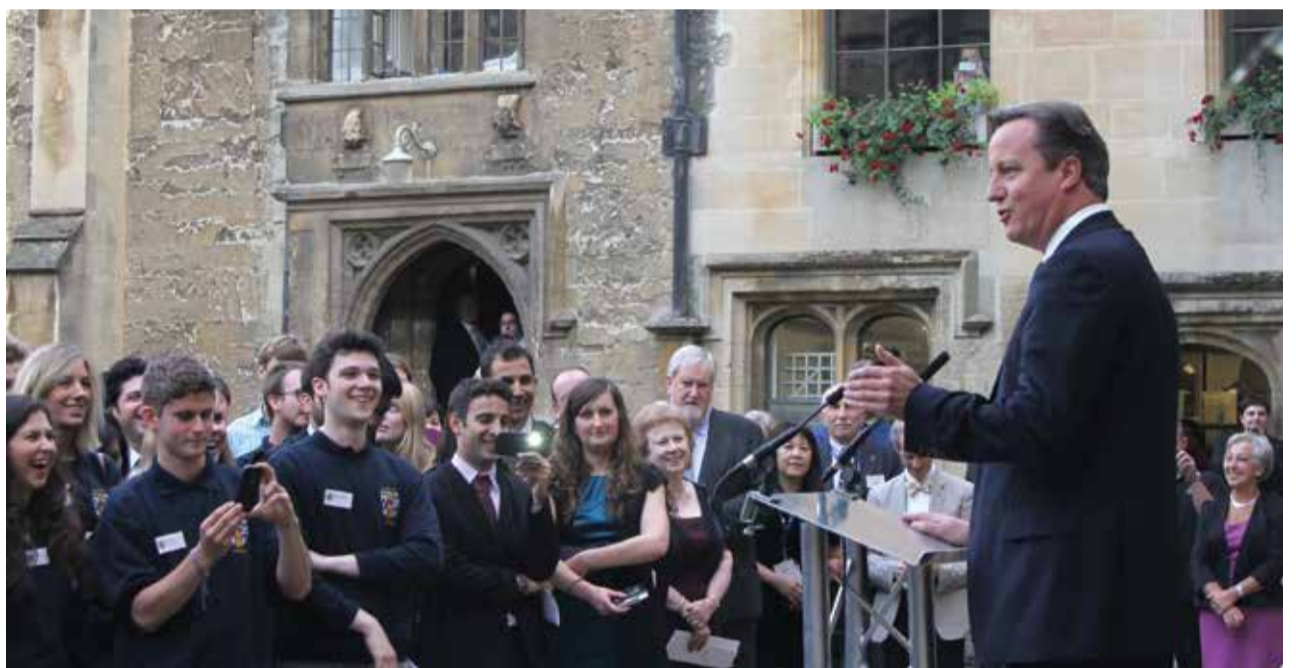
△ David Cameron visits Brasenose, 20 September 2013

This visit was happily marked by another cause for celebration - the completion of our recent Classics Campaign. This has enabled us to endow a Fellowship, which will permanently ensure the future of Classics teaching at BNC. We are proud of this result and particularly grateful to those who generously supported the campaign, without whom this outcome could not have been achieved.