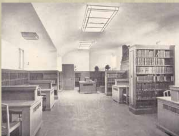
△ The Hulme (History) Library, 1951

In 1950 a fire broke out between the Library and the Brasenose Tower. During the repairs the Hulme (History) Library was created on the top floor (formerly undergraduate rooms).