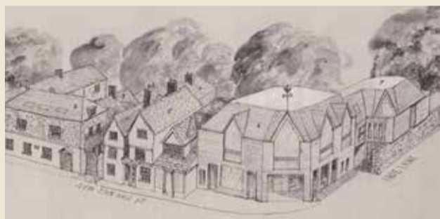
△ Frewin Hall and New Inn Hall Street (Brasenose 1978)

Alongside Brasenose going co-educational, in 1975 the College started to develop the site at Frewin Hall to provide extra accommodation for its members. The admissions procedure was also starting to change. Whilst Brasenose first moved to create an office of Tutor of Admissions in 1948, in 1976 the College issued a 16-page prospectus with a coloured cover. This was such an innovation that the Brazen Nose reported that Brasenose was the first Oxford College to have one! In the same year, under the Cheshire Admissions Scheme, it was also agreed that three places per year should be reserved for pupils from Cheshire comprehensive schools, for an experimental period of five years.