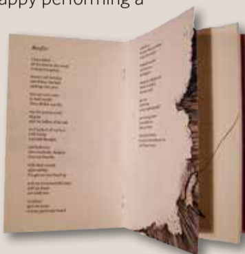
△ Pages from 'The Flower and the Plough'

As it turned out, my Classics degree did come in handy after all. Where else would I have learned to work long hours, in a variety of different disciplines, and exercise extreme diplomacy with my colleagues? After the exhilaration of surviving Greats (just), I couldn't be happy performing a single, specialised role within a large company. I love doing everything myself, from the editing to the publicity and sales, and I hope I never have to be an employee again.