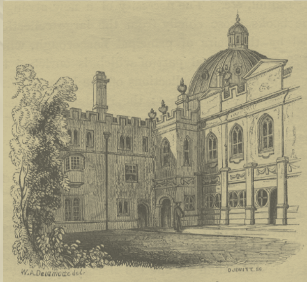
△ Library and Old Cloisters overlooked by the Radcliffe Camera, 1835

Preparations for building the Brasenose Library started in November 1657, and the foundations were begun in March 1658.