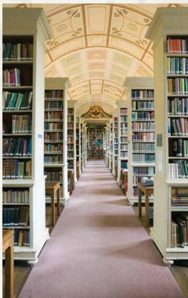
△ Brasenose College main Library, 2013