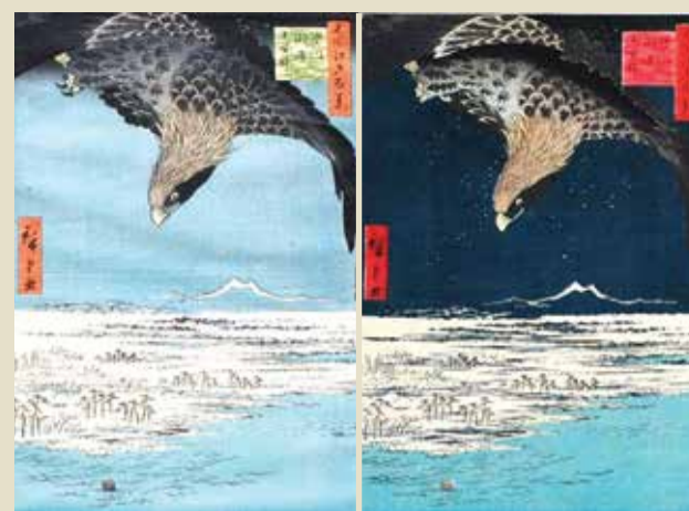
△ 19th Century Japanese landscapes used in the study

Working with Professor Glyn Humphreys, pairs of Japanese woodblock prints, ancient Greek ceramics, and seventeenth-century English silver, were selected from the museum departments, each manifesting some variation in condition, colour or design.