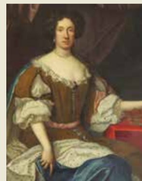
△ The Duchess of Somerset

In 1974 28 women students matriculated and from then on the number of women undergraduates continued to increase. By October 1977 the numbers stood at 294 men and 131 women. Furthermore, the Fellowship welcomed its first woman Fellow in 1981.