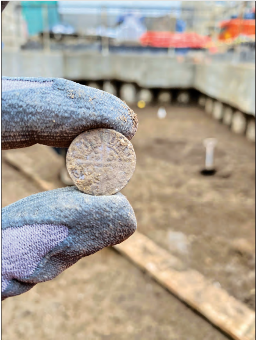
Silver 'long cross' penny of Edward I, King of England Lord of Ireland (AD 1272–1307). Struck in London c. 1280.