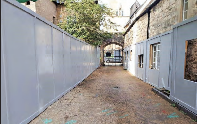
Protective boarding was put in place to prevent damage to the historic walls at Frewin.