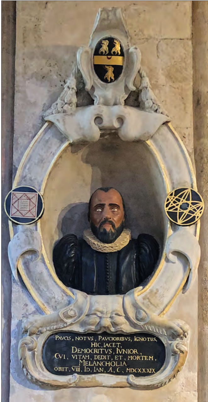
The Burton Coat of Arms from Christ Church Cathedral.