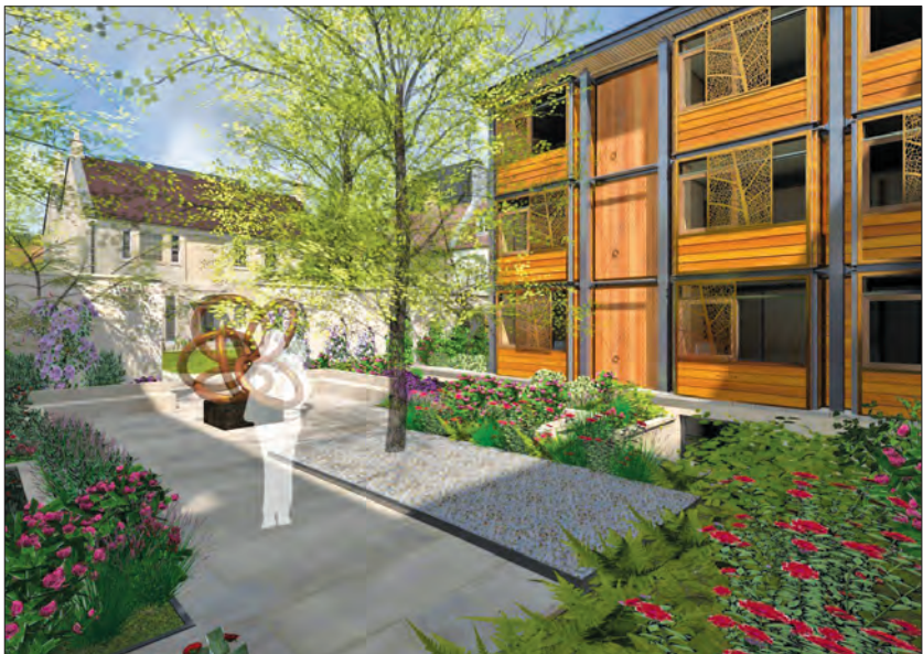
An artist's impression of the new student accommodation block at the Frewin Annexe.