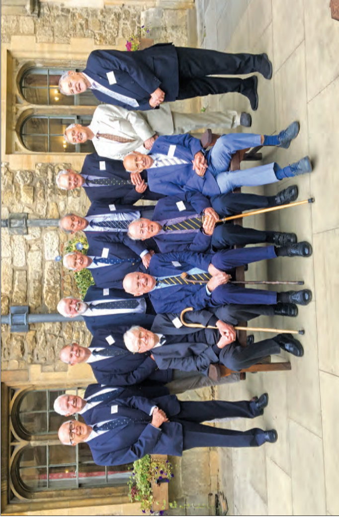
In the calendar year 1961 sportsmen from college won three Cuppers competitions, namely Athletics, Rugby and Hockey. On Thursday the 23rd September 2021, 13 surviving members from those teams held a celebratory lunch in college to mark the 60th anniversary of their achievement. 10 others presented their apologies because of distance (Australia and USA) or health grounds.