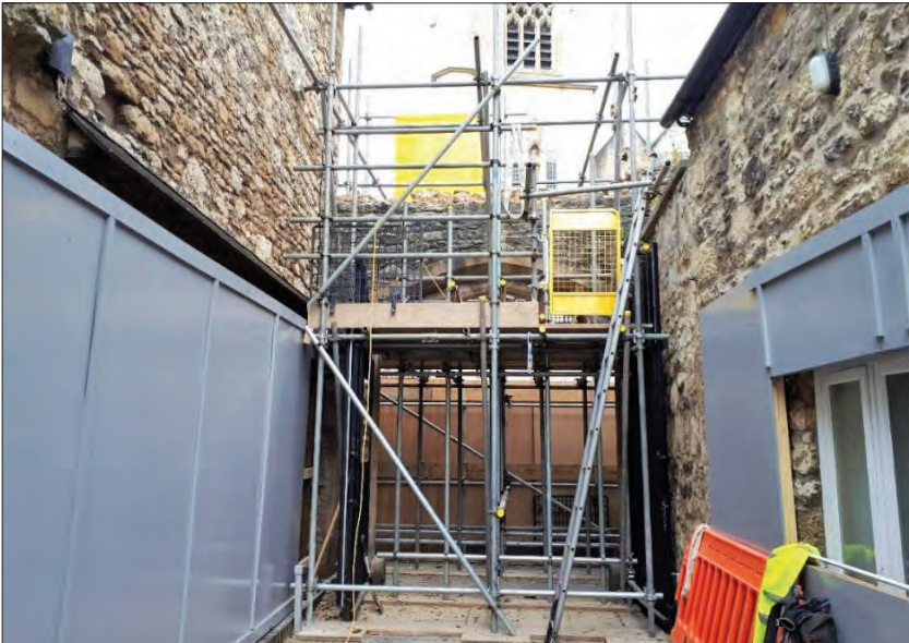
The existing Frewin archway was temporarily removed, with the stone stored onsite so that it can be rebuilt at the end of the project. Oxford archaeology maintained a watching brief during the removal of the arch and the protection of the historic walls.