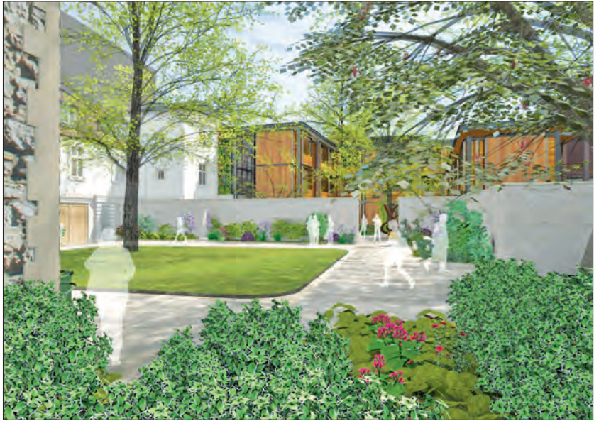
An artist's impression of the redeveloped quad at the Frewin Annexe.