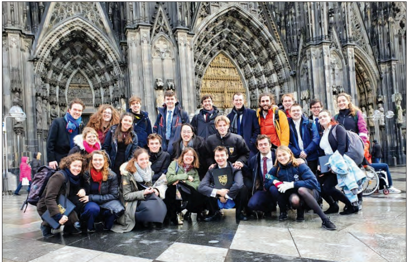
Choir in front of Kölner Dom