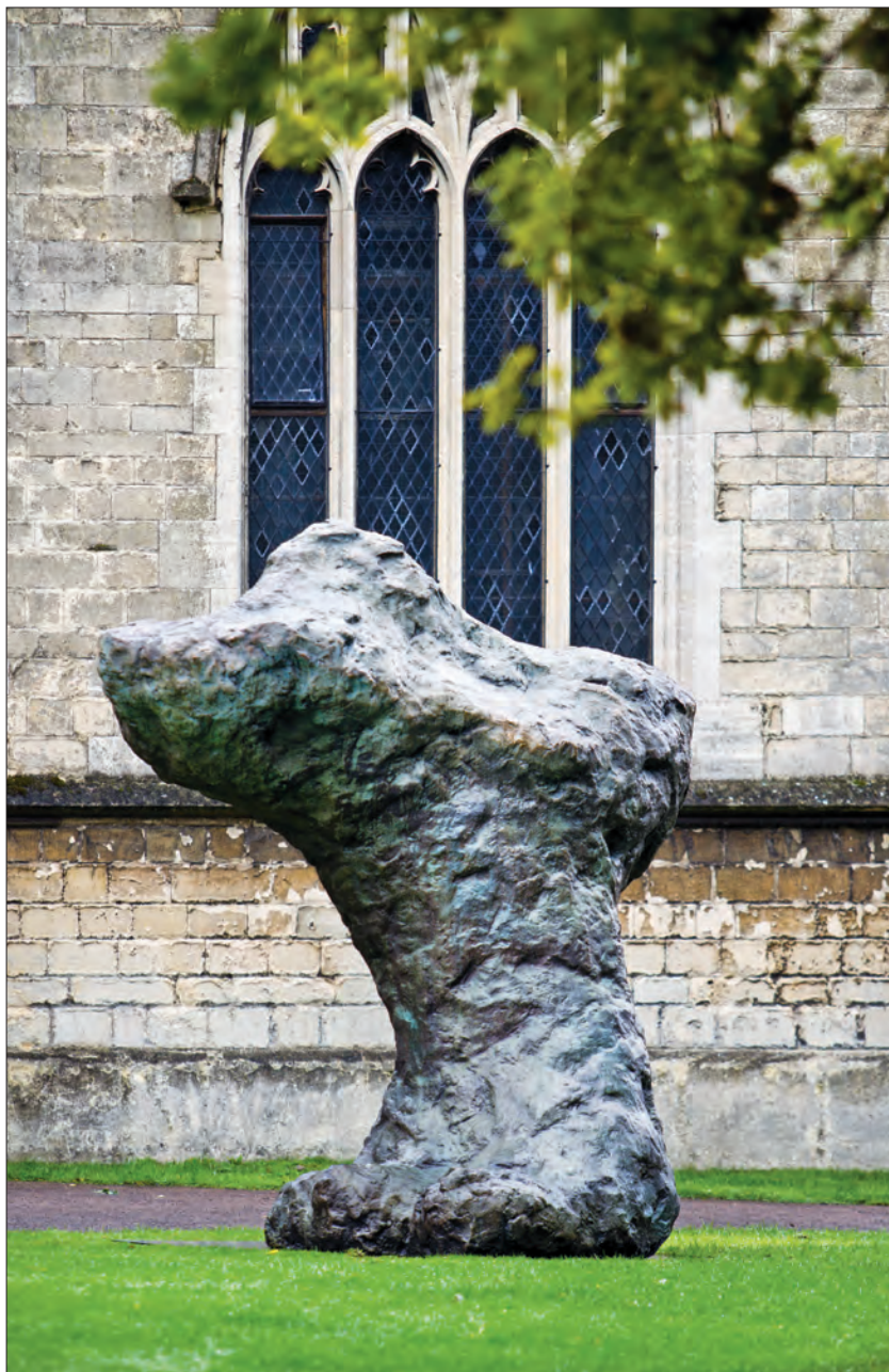
Messenger by William Tucker RA (Modern History, 1955)