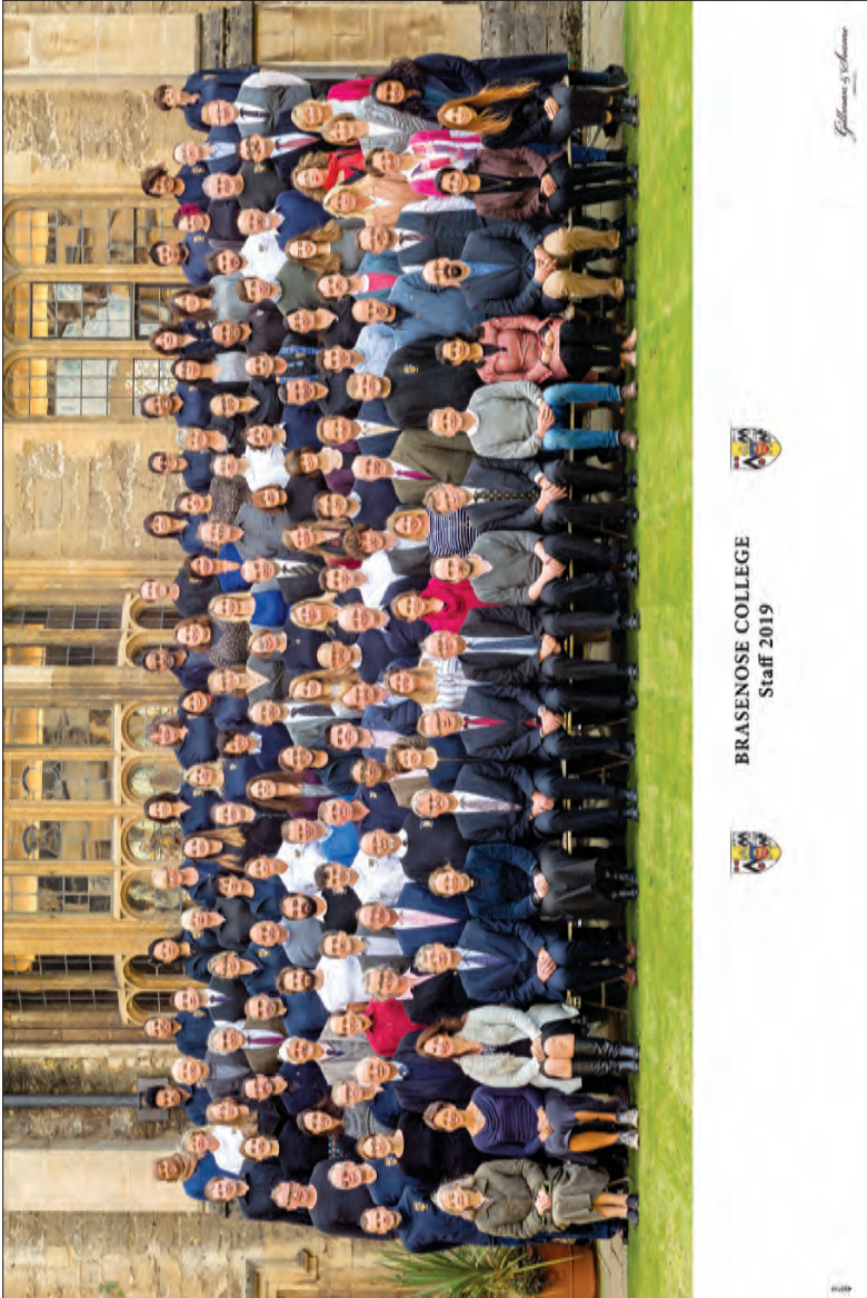
Brasenose 2019 Group Photo