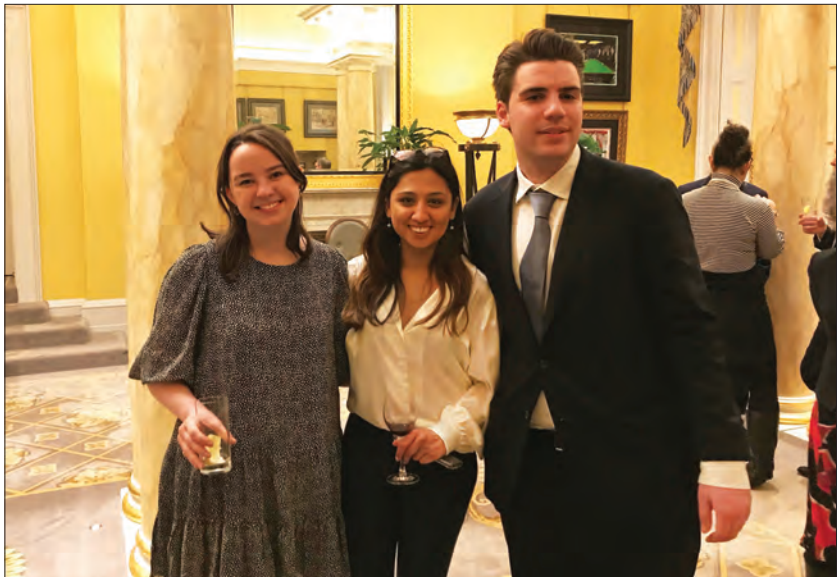
O&C Club Drinks and Year Rep meeting, 3rd March 2020