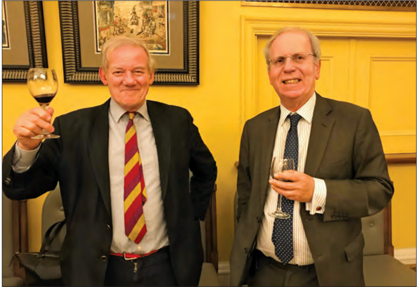
O&C Club Drinks and Year Rep meeting, 3rd March 2020