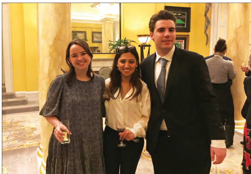
O&C Club Drinks and Year Rep meeting, 3rd March 2020