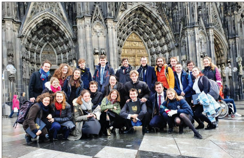
Choir in front of Kölner Dom