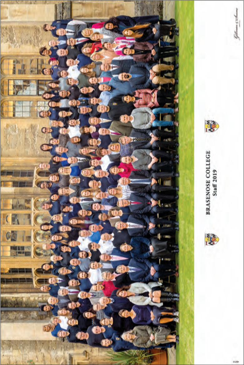
Brasenose 2019 Group Photo