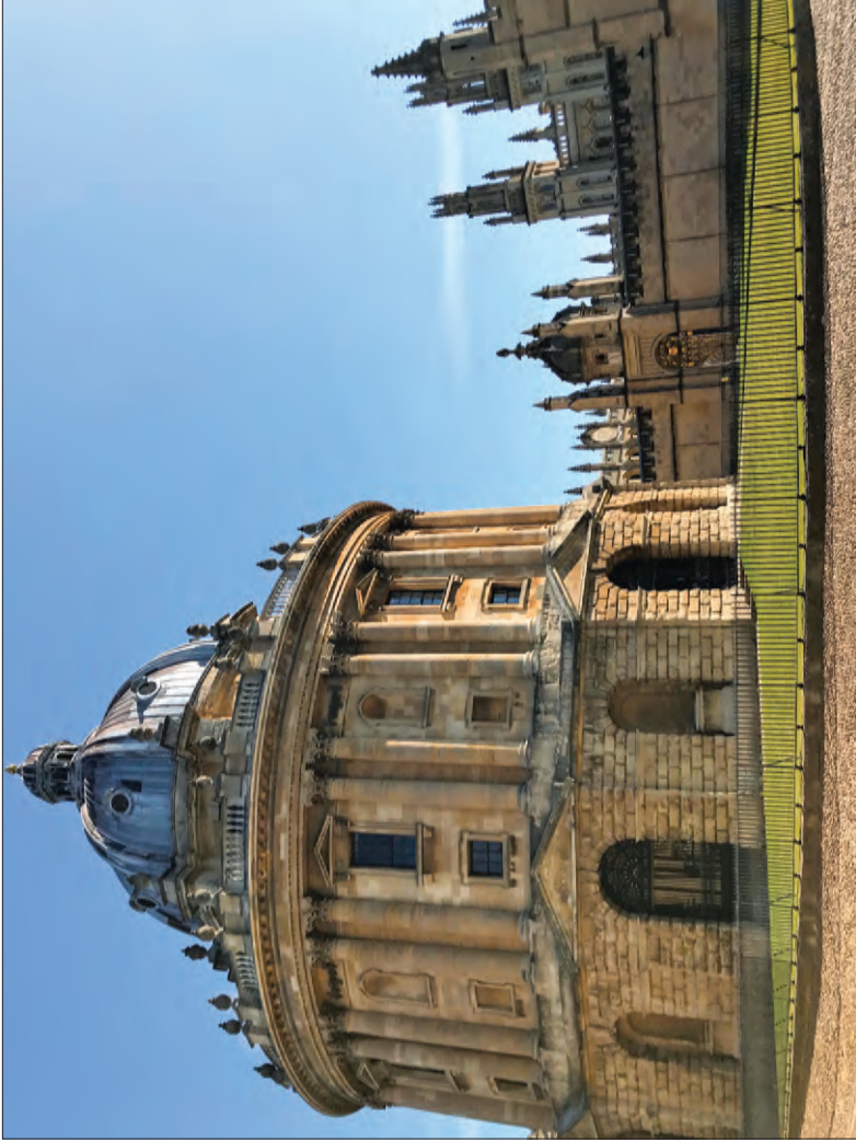
An unpopulated Radcliffe Square in Trinity Term