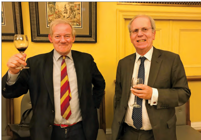
O&C Club Drinks and Year Rep meeting, 3rd March 2020